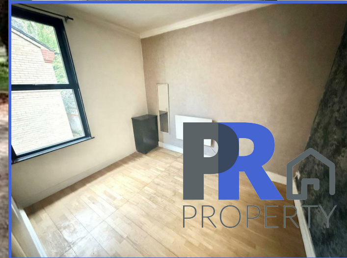
Flat 6, Woodland Court Hart Hill Drive, Luton, LU2 0AX £925 Per month